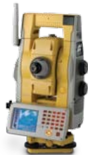
GPT-9000A/GTS-900A SERIES Advanced Robotic Instrument System

Topcon's new 9000A-series Robotic Systems: Superior Technology - Superior Design - Superior Performance and Value: only from Topcon, the World Leader in Precision Measurement Technology.